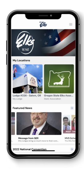
The My Elks Mobile App

Oregon State Elks Association The My Elks App