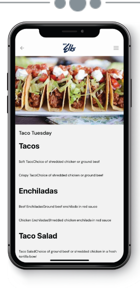
Event post with menu on the My Elks App