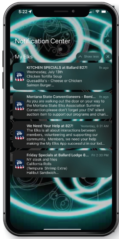
Notifications from the My Elks Mobile App