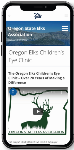
State major project post in the My Elks App