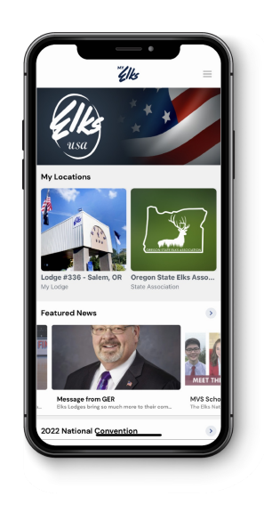
The My Elks Mobile App